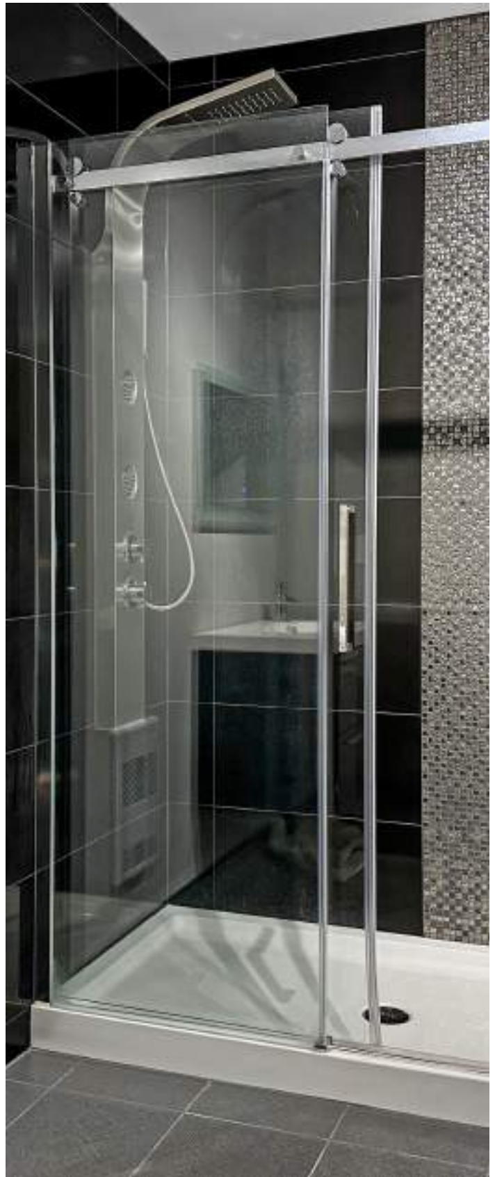
ENSUITE BATHROOM GLASS SHOWER