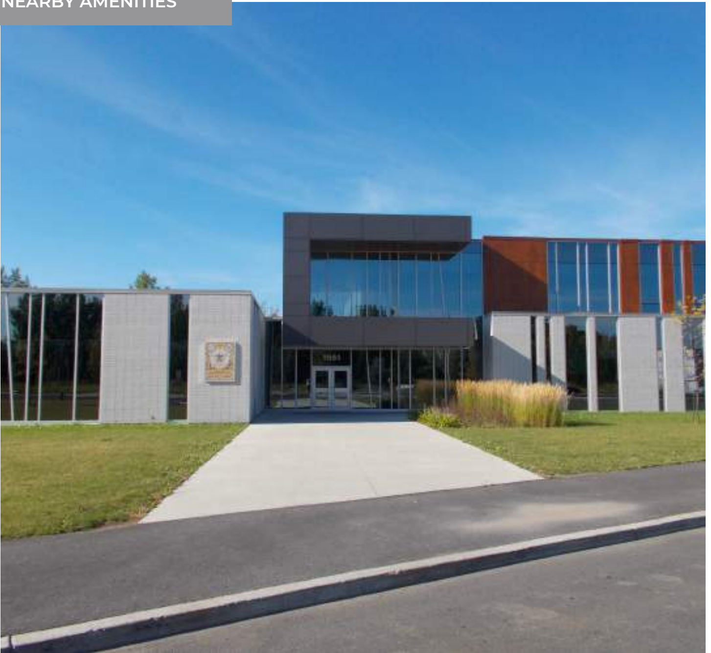
CARIGNAN-SALIÈRES ELEMENTARY SCHOOL