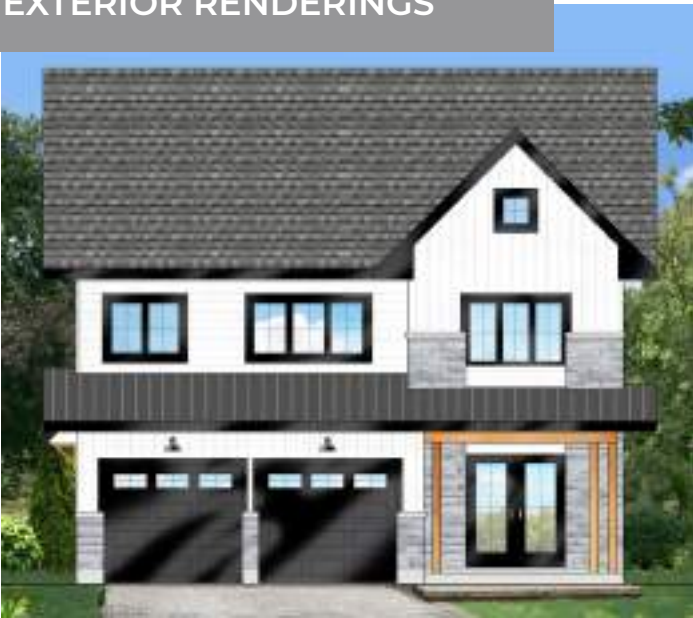
MODEL OPTION 1