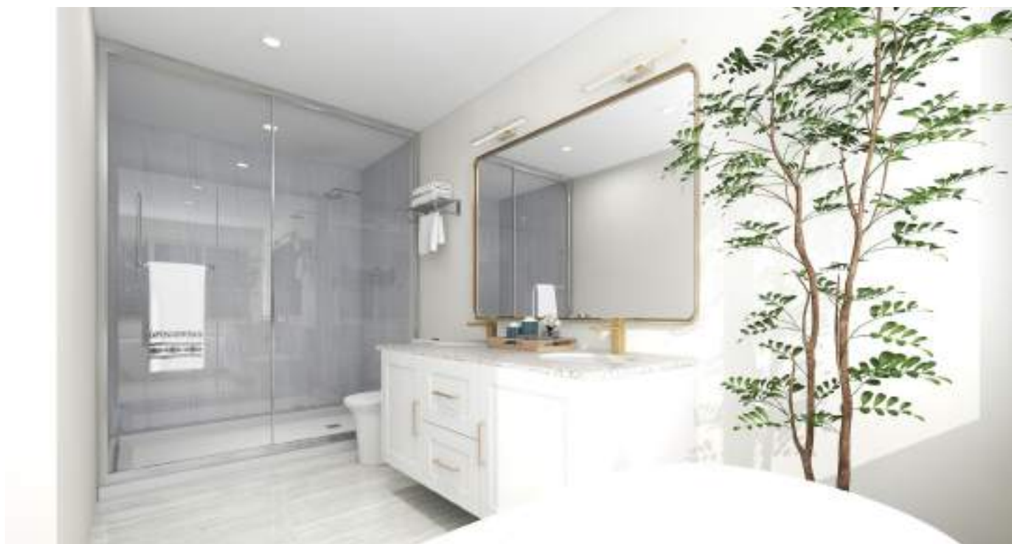
PRIMARY BEDROOM ENSUITE BATHROOM