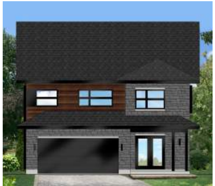
MODEL OPTION 2