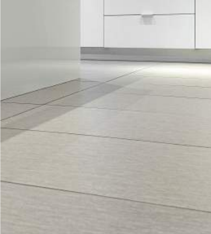
12" X 24" PORCELAIN TILE